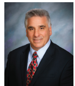
President &amp; CEO

Our strong financial position continues to provide our members with the assurance that their trusted financial institution is both safe and secure. As we move into 2025, we remain committed to helping our members achieve their financial goals.